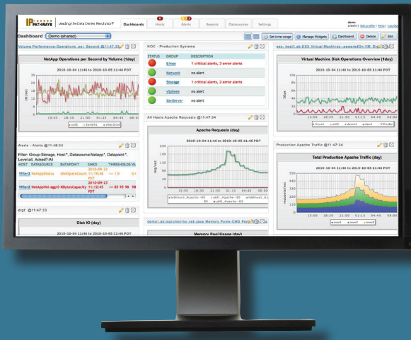
Dashboard view of your IP Pathways Intelligent Monitoring Service Application

We install a lightweight Data Collector on a server inside your network. The Collector collects metrics from your devices and forwards it via secure SSL to our off-site Intelligent Monitoring Processing Servers. If thresholds are exceeded, your engineers are alerted via email and/or phone to investigate the issue. If requested, we can resolve the issue remotely without you even knowing there was an issue. In some cases, an on-site visit will be required to resolve the issue. Either way, you get peace of mind knowing that issues will be caught early, before they escalate into larger issues that impact your business.